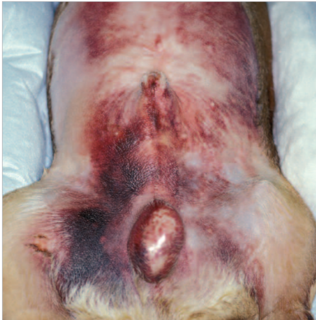
Figure 1. Bruising on the abdomen of a dog with a history of blunt abdominal trauma.

idly assessed and initial fluid restoration initiated. A complete history and thorough physical examination can be done once the patient has been stabilized. 7 Pertinent information to obtain while taking a history includes the nature of the trauma, when the incident occurred, and progression of clinical signs since the traumatic incident. Owners should also be questioned about the animal's mental status since the accident; amount of external blood loss; ability to ambulate; and status regarding vomiting, dyspnea, urination, and defecation. A thorough history allows emergency diagnostics to be targeted to the injury site and provides an overall assessment of an animal.