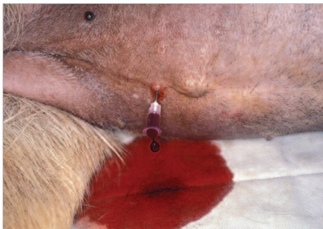
Figure 3. Simple open-needle paracentesis performed with a 20-gauge, 1.5-inch needle at the level of the umbilicus, illustrating the presence of nonclotting free blood characteristic of hemoperitoneum.