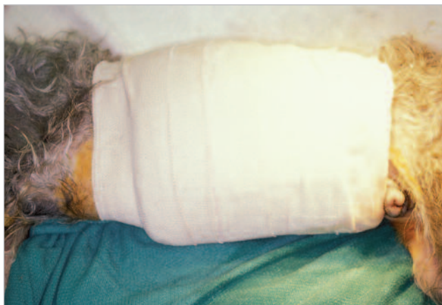
Figure 5. External abdominal counterpressure to arrest intraabdominal hemorrhage in a dog.

Staged release of the bandage every few minutes is recommended once vital signs, blood pressure, and pulse pressures have been stabilized because abrupt removal of the wrap has been shown to decrease MAP. 25 MAP should be measured during staged wrap removal to avoid a decrease in systemic arterial blood pressure of more than 5 mm Hg, which could lead to life-threatening hypotension. 27 If systemic blood pressure decreases more than 5 mm Hg, staged removal should be discontinued temporarily and aggressive IV fluid replacement instituted until hemodynamic stabilization can be achieved. Ideally, the following variables should be monitored approximately every 5 minutes when using external counterpressure: heart rate, respiratory rate and effort, hematocrit, total protein level, oxygen saturation, MAP, IAP, and urine output. 25,26,28,29